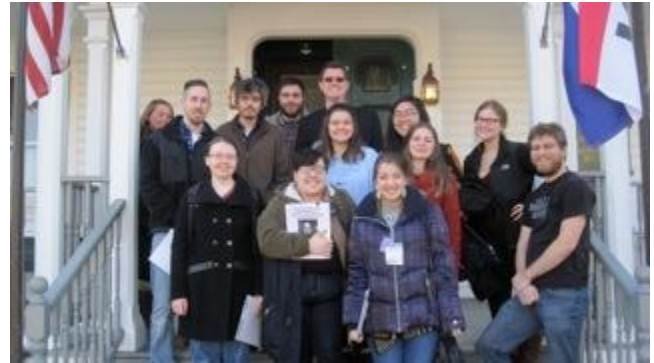
St. Rose Grad English Students at Melville House on 2/7

include a dinner and a special speaker. A silent auction and raffle will also be featured. Further information will be announced.