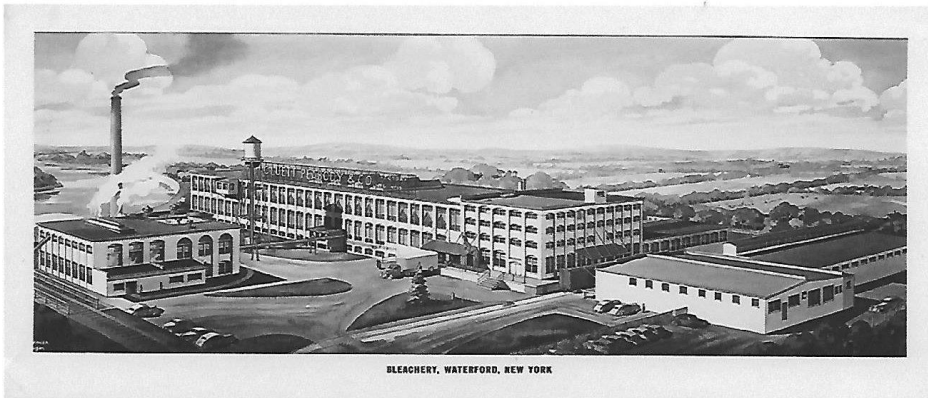
The Cluett, Peabody and Company Bleachery on Peebles Island, c. 1940.