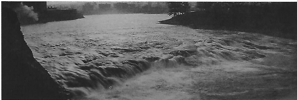
Photograph of Buttermilk Falls (or "Little Falls") on the Mohawk River, ca. 1900.